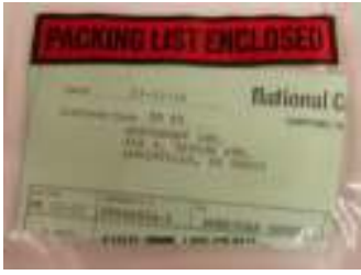
LOCATION OF INDICATOR